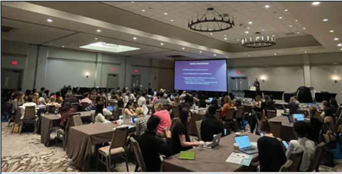
Presentations covered facial aesthetics, injectable anatomy, chemical peels, vein treatments, cosmeceuticals and more.