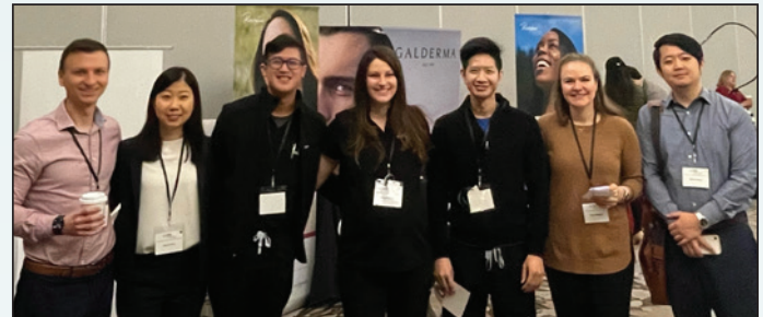
Residents spoke with industry representatives in the exhibit area.

"All of the lectures were amazing and relevant and taught in a way to the level of resident but with PEARLS that were fantastic and so helpful!! Loved meeting all the faculty and getting to network. Makes me want to definitely continue to participate with ASDS!"