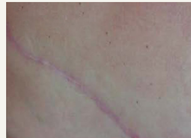
SCAR WITH SURGICAL TAPE ALONE