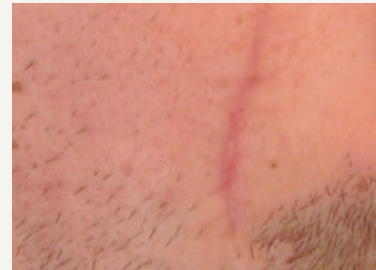
SCAR AT 2 WEEKS