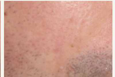
SCAR AT 6 MONTHS