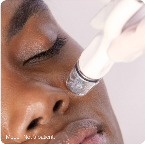
Model. Not a patient.

HA 5 ® Hyaluronic Acid Pro-Infusion Serum